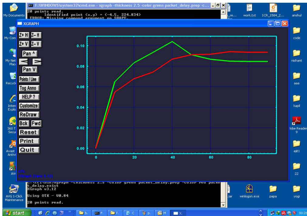
Figure 4: Packet Delay Analysis

Here figure 3 is showing the packet loss analysis over the network in case of existing and proposed work. Figure shows that the packet loss in case of proposed work is much lesser than existing work. In this figure, x axis represents the simulation time and y axis shows the packet communication loss.