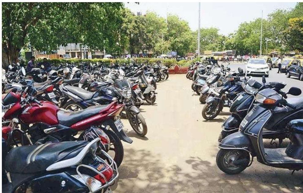
Figure 6: PGIMS Rohtak Parking site