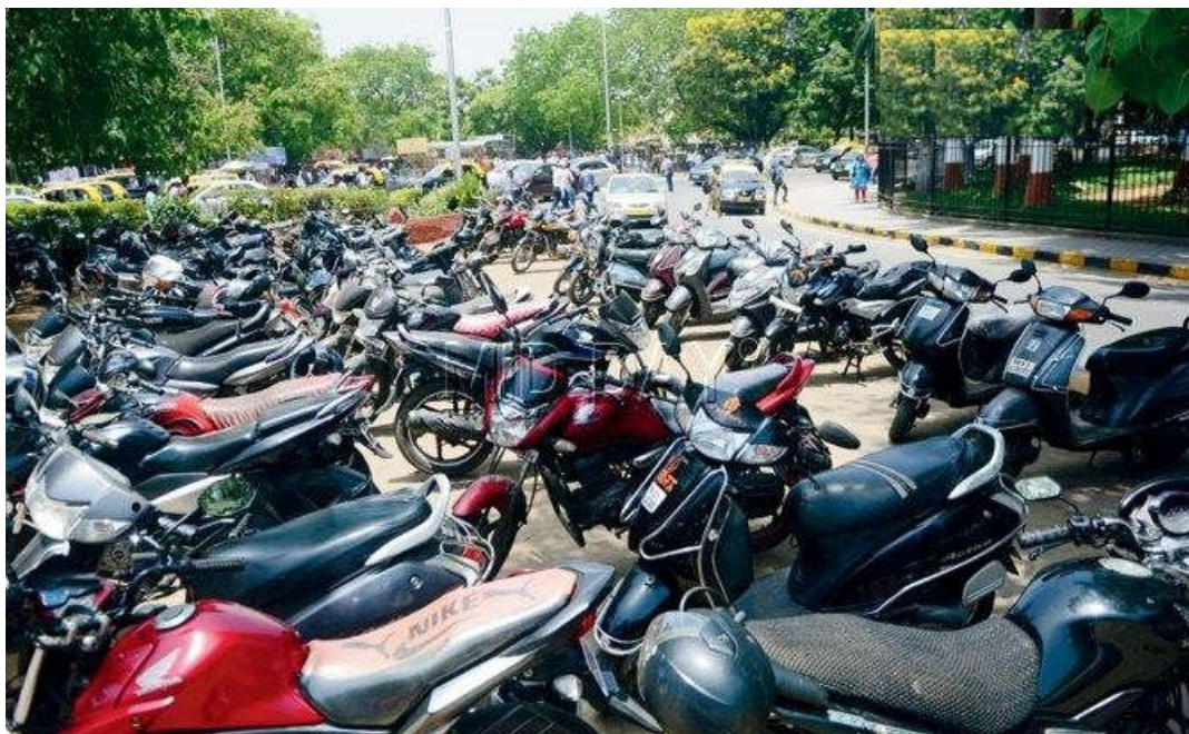
Figure 5: MDU Rohtak Parking site