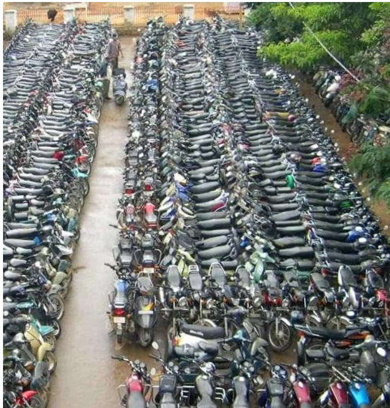
Figure 2: Rohtak Railway Station Parking site in day time