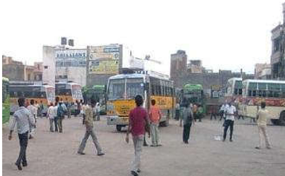
Figure 4: Rohtak Old Bus Stand Parking site for buses