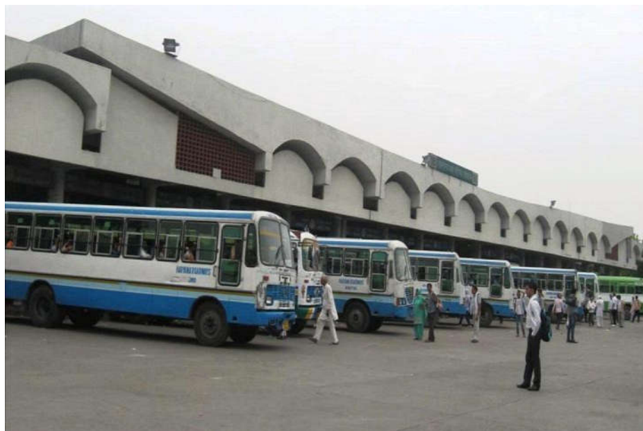
Figure 3: Rohtak New Bus Stand Parking site for buses