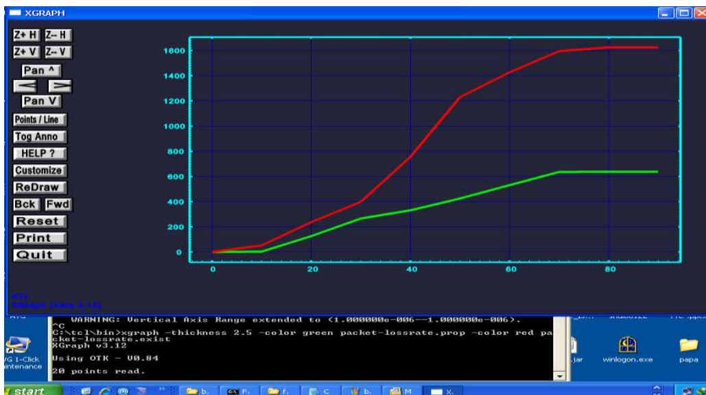
Figure 3: Packet Loss Analysis

Figure 2 depict that the packet communication is been increased continuously in proposed approach. As the nodes are dead no more communication is performed over the network. Here straight line represents the dead network situation. In this figure, x axis represents the simulation time and y axis shows the packet communication. Here the figure is showing the packet communication specifically for proposed work. The figure shows that initially the packet communication in case of proposed work is higher.