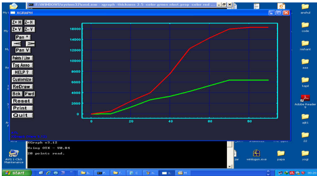
Figure 2: Packet Transmission Analysis

Here figure 1 is showing the communication parameters based on the random scenario taken in this work. The scenario is defined with specification of network parameters, communication parameters and the protocol specification. The table shows that the network nodes are defined with energy restriction. The communication control is provided in this work using AODV protocol.