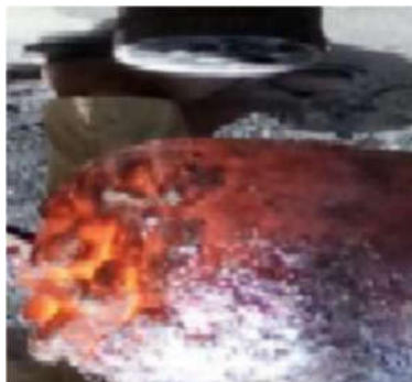
Figure 2: Pouring of Liquid MMC

The stirred liquid metal matrix composite further poured into to sand moulds of 20mm diameter and 1 foot of length as shown in figure 5.2.