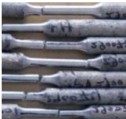
Figure 5: Samples after Ultimate Tensile Strength Test

Ultimate tensile strength (UTS) often shortened to tensile strength (TS) or ultimate strength, is the maximum stress that a material can withstand while being stretched or pulled before failing or breaking. The UTS is usually found by performing a tensile test and recording the engineering stress versus strain curve. The highest point on the stress-strain curve is the UTS. In present work, IS 1608-2005 Universal Testing Method is used to find out UTS in MPa.