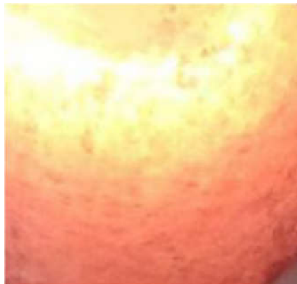
Figure 1: Melting of Aluminium Alloy 6082

Melting point of Aluminium Alloy 6082 is 550°C. In present work, first of the graphite crucible heated to 600°C for 10minutes. and work pieces of AA 6082 putted in the heated graphite crucible. Further it heated to 700°C for completely melt the AA 6082. It takes near about 20minutes.