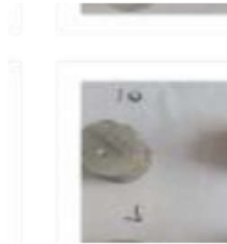
Figure 4: Samples after Hardness Test

Hardness is a measure of how resistant solid matter is to various kinds of permanent shape change when a compressive force is applied. Some material such as metal, are harder than others. In present work, IS 1500(Part-1)-2013 Brinell hardness test method is used to find out the hardness of fabricated composites. In this method aluminium alloy composites are tested using 250Kg test force and a 5mm carbide ball.