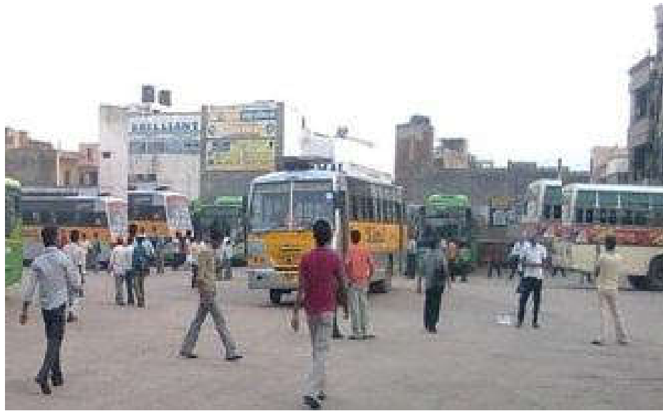
Figure 4: Rohtak Old Bus Stand Parking site for buses