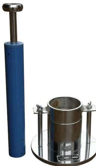
Fig. 2: Modified Proctor test apparatus

The graphical relationship of the dry density to wet content is then forethought considering the values found to ascertain the compaction curve. The determined curve comes in parabolic form and dry density worth is increasing up to a most limit and at that time once more the worth reduced. the utmost dry density is finally obtained from the height purpose of the compaction curve and its corresponding wet content, that is thought because the optimum wet content (OMC). Used formulas square measure listed below.